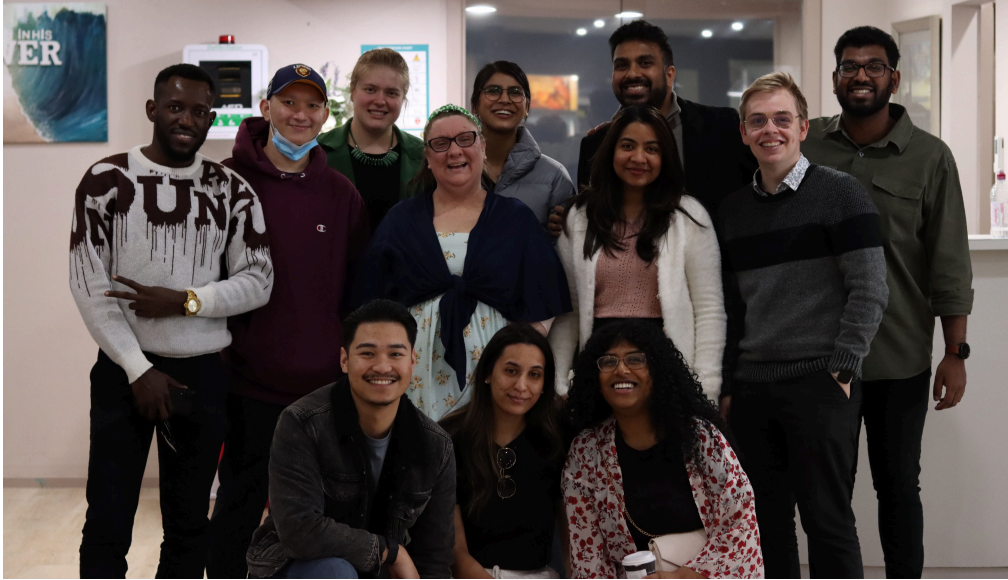
**Growing leaders in our Lighthouse Family Christian Church's Young Adults Life Group